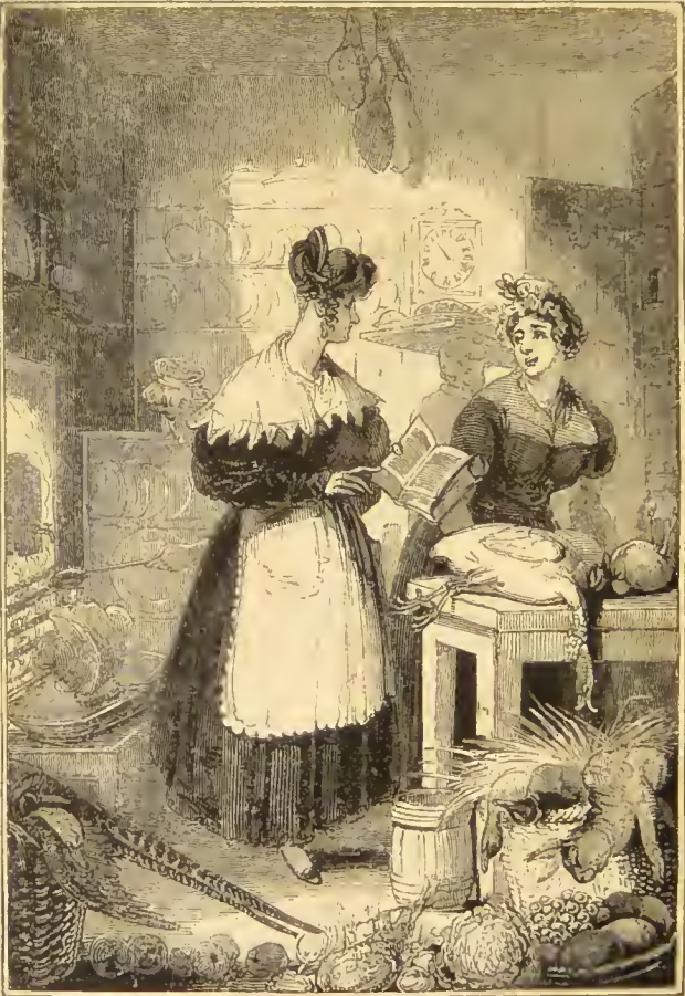
THE FRUGAL HOUSEWIFE.